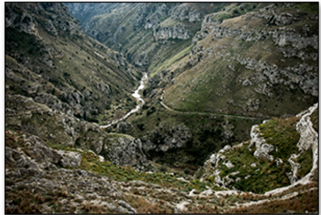
Gravina di Matera Bret Culp