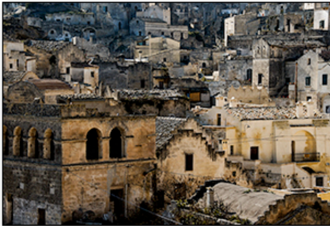
Sassi di Matera Bret Culp

I am excited to be working on a new body of photographs from the Basilicata region in southern Italy. While I have been focused on black and white photography for the past several years I could not ignore the power of the colours of the area. The following is a sneak peak work in progress.