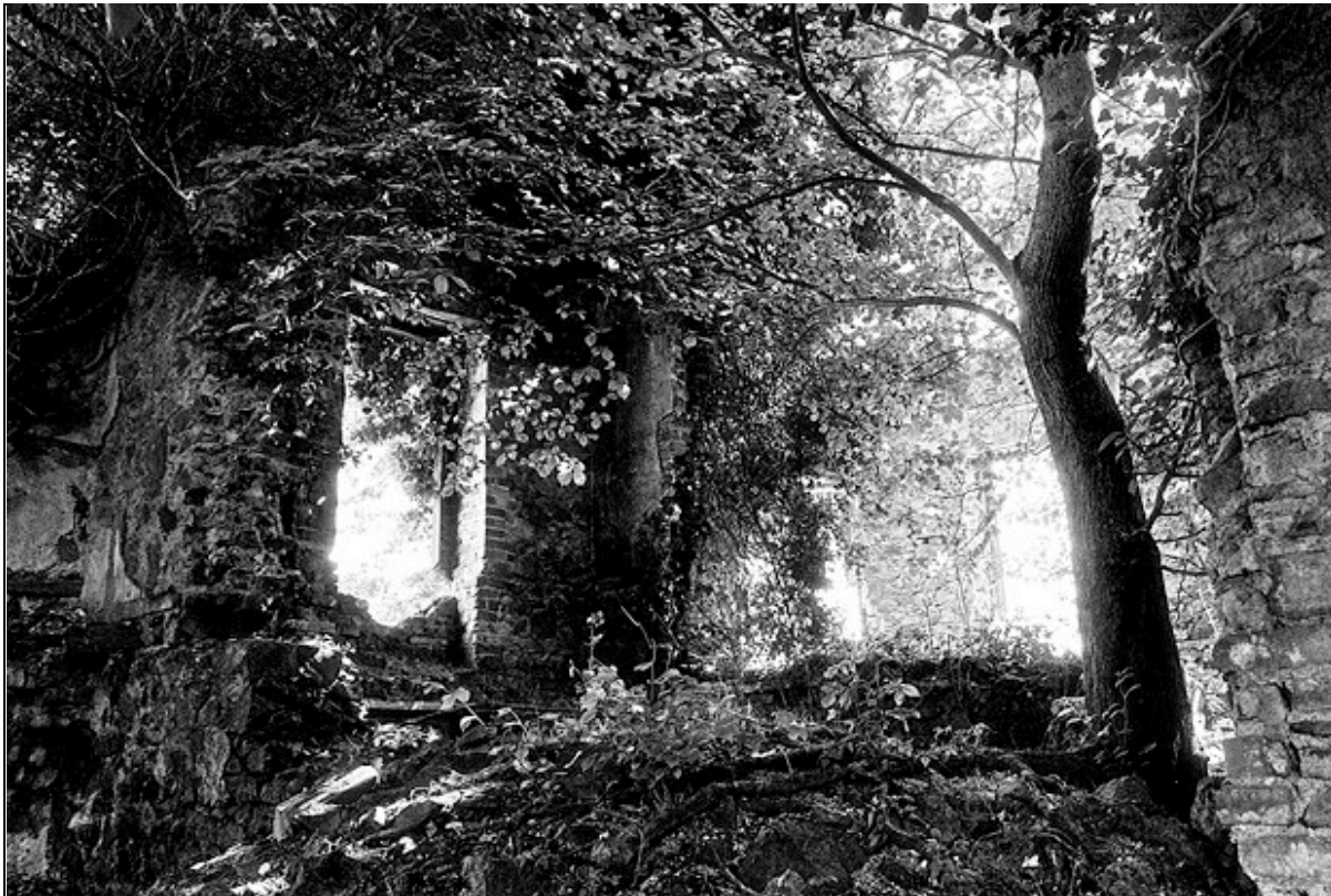
Reclamation 2 | archival pigment on photo rag, 2008 Bray, Wicklow, Ireland

Leonardo Gallery | info@leonardogalleries.com | 416-924-7296