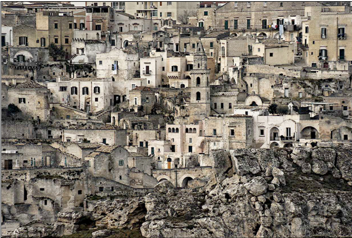
Stone of Matera | Basilicata, Italy (work-in-progress)